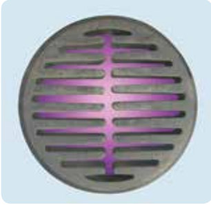
Patented AluFer Tubes®

The internationally patented AluFer tube is the technology behind the advanced heat transfer design. The tube is constructed from an inner (fireside) aluminum alloy finned surface, die-fitted within an outer steel tube, providing exceptional heat exchange characteristics.